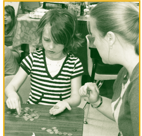
On last year's New York State math proficiency exams, 95% of Mayfield students in grades 3-8 scored at Level II or better, and 81% scored at Level III or IV, Level IV being the highest.

Despite a budget-to-budget spending decrease, the Board of Education is proposing to increase the tax levy because other revenue sources are declining. Depending on the final outcome of the state budget negotiations, Mayfield could lose up